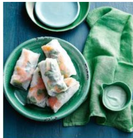
Avocado & Salmon Rolls