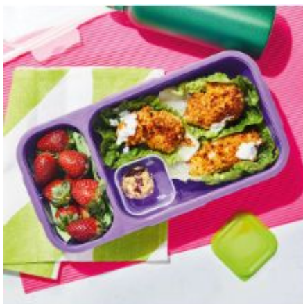
Chicken Nugget Wraps

https://www.woolworths.com.au/shop/recipes/back-to-school/easy-plan-ahead-lunch-box-ideas