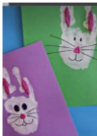
Easter Art activities done by our lovely Kids.