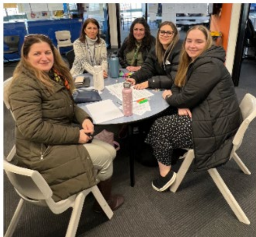
(Our Year 3/4 Team)