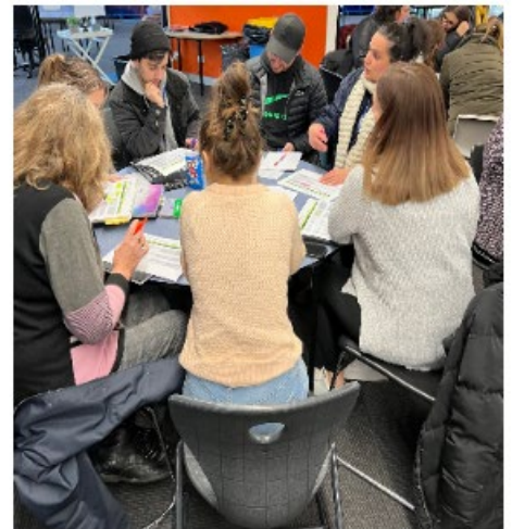
(Our Year 1/2 Team)