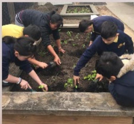
Community Hub Volunteers teaching students how to plant and grow food